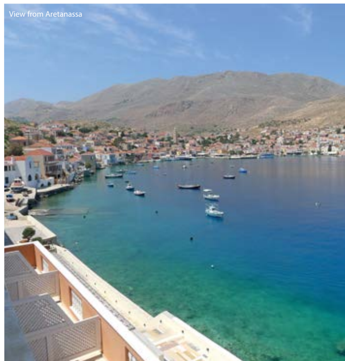
View from Aretanassa